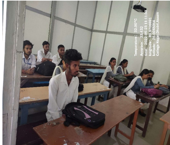
Students of B. A. 4 th Semester Honours attending the Class